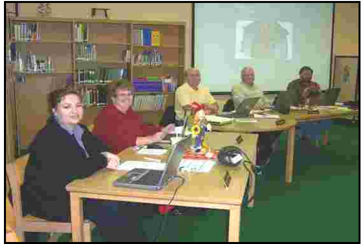
Randolph County is working hard to maximize resources, the MC School Board has joined the "Go Green" game!

The use of laptops at board meetings, in place of the traditional paper packets, has been very valuable for school board members. Not only can they do their part