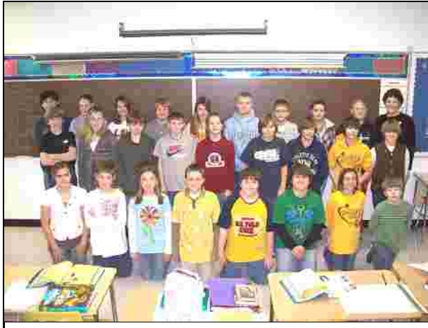
Members of the 6 th Grade Class